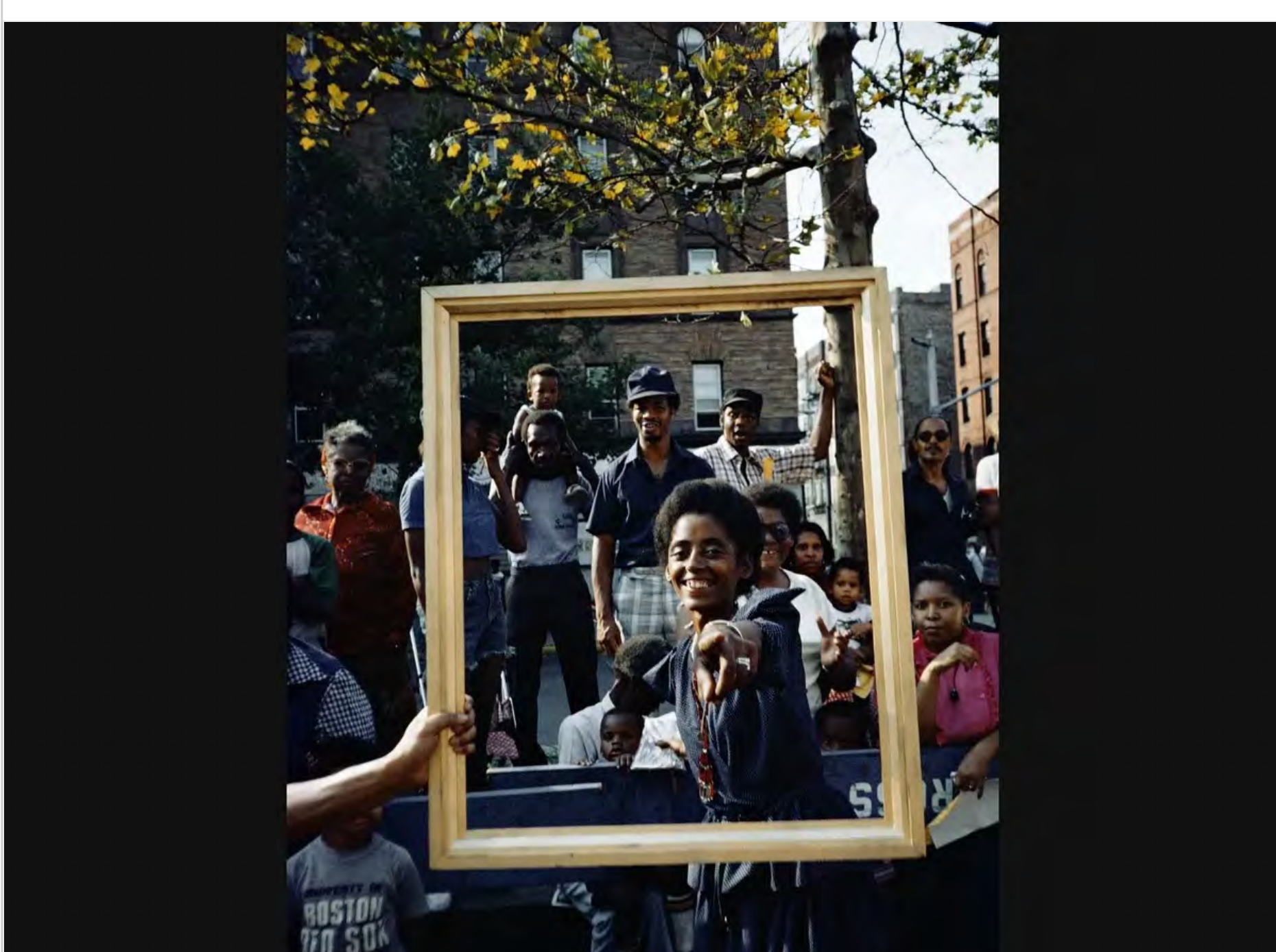
Lorraine O'Grady (American, born 1934). Art Is . . . (Girl Pointing), 1983/2009. Chromogenic photograph in 40 parts, 20 x 16 in. (50.8 x 40.64 cm). Edition of 8 plus 1 artist's proof. © 2023 Lorraine O'Grady/Artist Rights Society (ARS), New York (Lorraine O'Grady)

Lorraine O'Grady '55, a critically acclaimed contemporary artist and cultural critic, returns to the Boston area with her retrospective exhibition Lorraine O'Grady: Both/And . This landmark exhibition will coincide with a performance art series, both of which are free and open to the public.