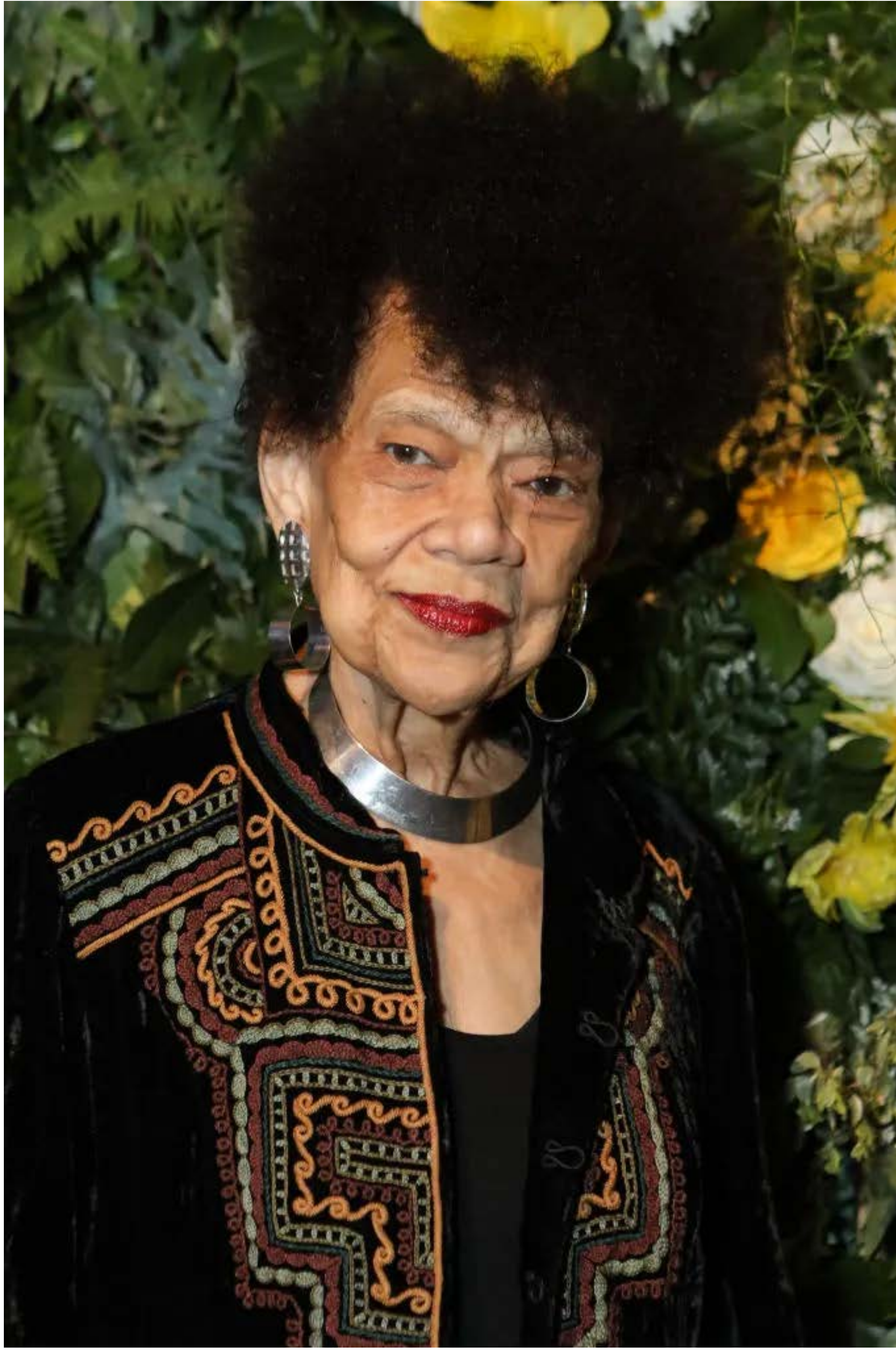
Lorraine O'Grady, New York, April 23, 2019.

SHARE Within days of the unofficial end of summer, marked in the US by Labor Day and in the UK by the passing of the August bank holiday, three closely watched artists affiliated with major galleries in these countries announced that they were switching allegiances. In the United States, conceptual artist Lorraine O'Grady revealed that she would be leaving her longtime New York gallery, Alexander Gray Associates, for Chicago's Mariane Ibrahim Gallery, while sculptor Carol Bove departed David Zwirner for Gagosian. Across the pond, Golden Lion winner Sonia Boyce, who earlier severed ties with London's Simon Lee Gallery, signed on with Hauser & Wirth (Boyce is still corepresented by Apalazzo Gallery in Brescia, Italy, which has supported her work for years).