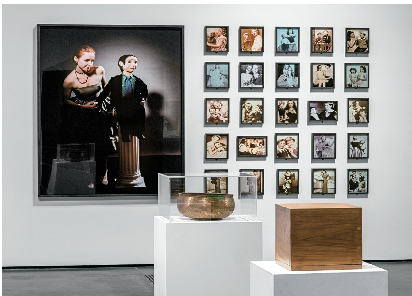
View of "Not I: Throwing Voices (1500 BCE–2020 CE)," 2021, Los Angeles County Museum of Art. Wall: Laurie Simmons, Girl Vent Press Shots, 1989. Pedestals, from left: Copper bowl, Afghanistan, late 15th century; Robert Morris, Box with the Sound of Its Own Making, 1961.