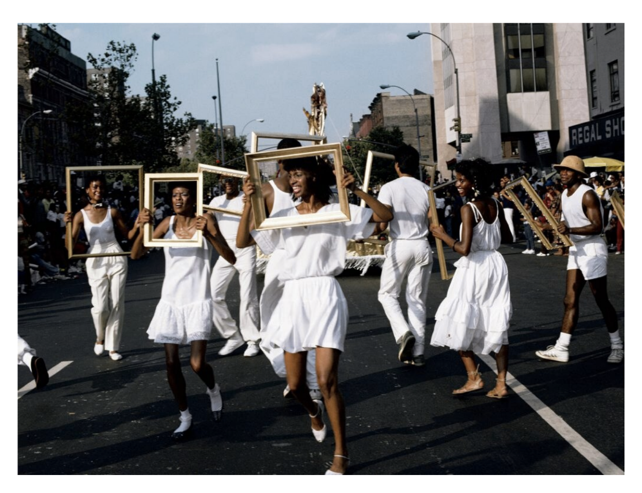
A photograph from Lorraine O'Grady's 1983 "Art Is..." performance.LORRAINE O'GRADY/ARTISTS RIGHTS SOCIETY (ARS), NEW YORK

By Murray Whyte Globe Staff, Updated March 17, 2021, 12:59 p.m.