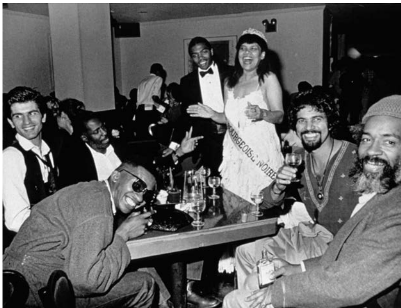
"Untitled (Mlle Bourgeoise Noire celebrates with her friends)," 1980–83/2009.

After graduating from college, where she majored in economics and languages, she embarked on an episodically writing-centered career. She worked as a researcher and translator for the Department of Labor in Washington, then moved to Europe to start a novel. In the early 1970s, she was in New York City contributing rock reviews to The Village Voice , and teaching courses on Dada and Surrealist writing at the School of Visual Arts. In short, hers was a distinctly "both/and" life, to which, in 1977, she added artmaking.