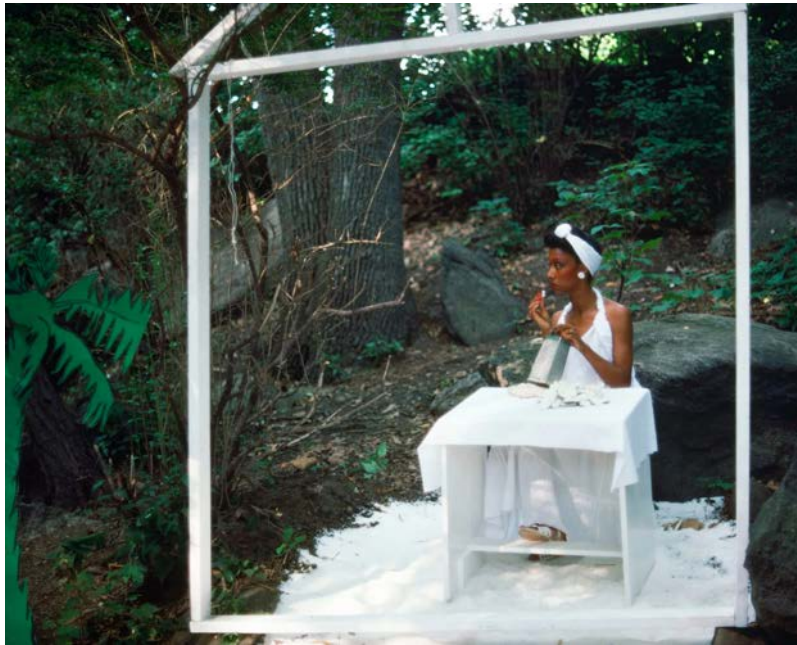
“Rivers, First Draft: The Woman in White eats coconut and looks away from the action,” 1982/2015.

O’Grady was on the float, too, smiling, watching this very public work of conceptual art unfold. My favorite of her performance pieces, though, dates from a year earlier, and was more private. Titled, “Rivers, First Draft, or The Woman in Red,” it’s a kind of semi-autobiographical “Pilgrim’s Progress.” Staged on a summer day, in a remote corner of Central Park, the piece symbolically re-enacts scenes from the artist’s life. An actor all dressed in white plays her aloof, impeccable mother; another plays O’Grady as a dreamy, bookish child. And the artist, dressed in passion-red, plays a version of her changing adult self. Traumas are enacted — romantic losses, political clashes, even a rape — but the narrative, paced like a Medieval mystery play and captured in 48 color photographs, ends with a ritualistic wade through healing waters and what feels like a state of peace.