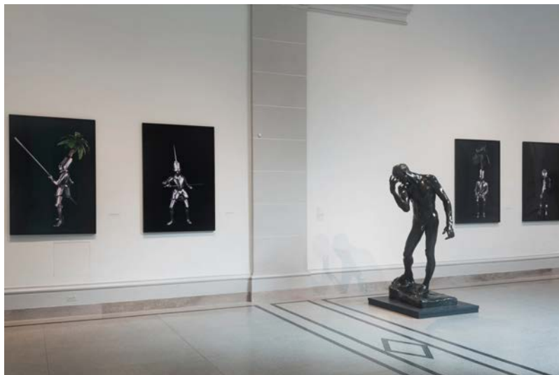
Installation view showing Lorraine O'Grady's knight-errant persona, her latest, on the third floor of the Brooklyn Museum.