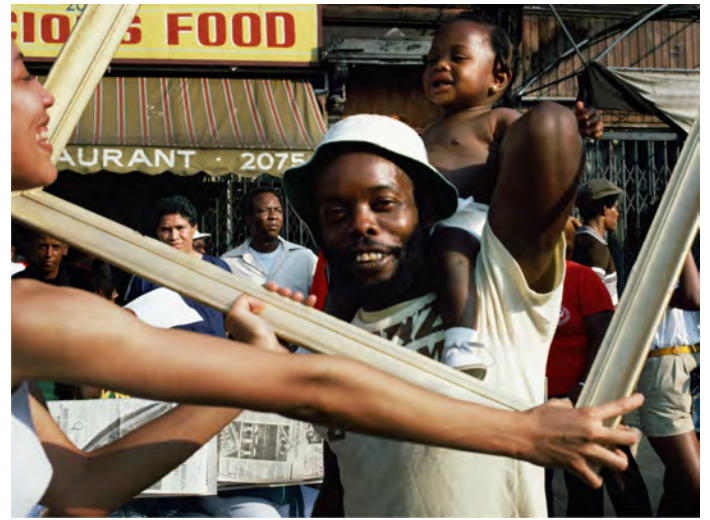
Lorraine O’Grady, “Art Is... (Man with Baby),” 1983/2009. Credit...Lorraine O’Grady/Artists Rights Society (ARS), New York

Another defining intervention, “Art Is...,” in 1983, took place at a parade in Harlem. O’Grady showed up with an unauthorized float — a flatbed truck mounted with a gigantic gold picture frame. Performers she had recruited jumped into the crowd carrying small frames, inviting people to pose, to see themselves as art.