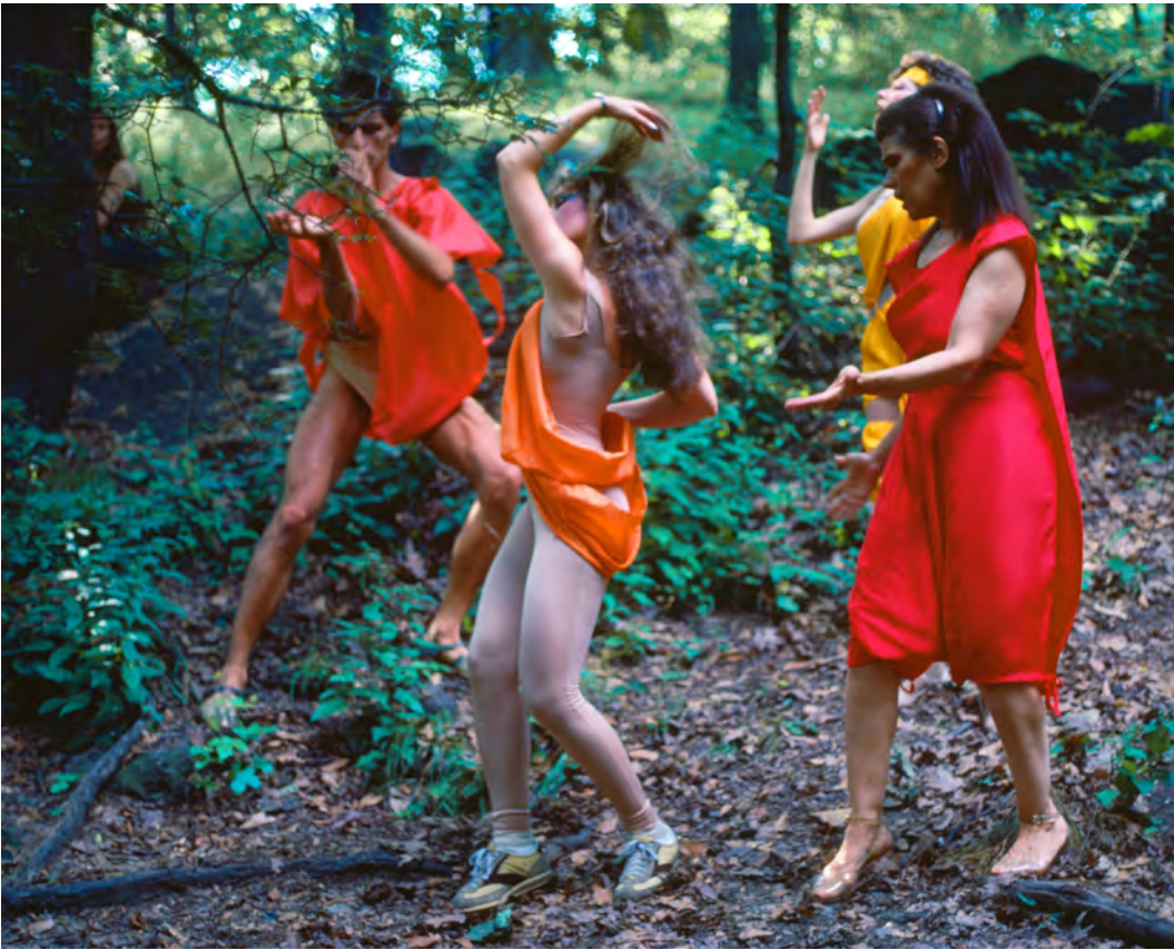
“Rivers, First Draft: The Debauchees dance in place, and the Woman in Red catches up to them,” 1982/2015. It showed apparent freedom, but revealed unacknowledged tensions. Lorraine O’Grady/Artists Rights Society (ARS)New York; Alexander Gray Associates