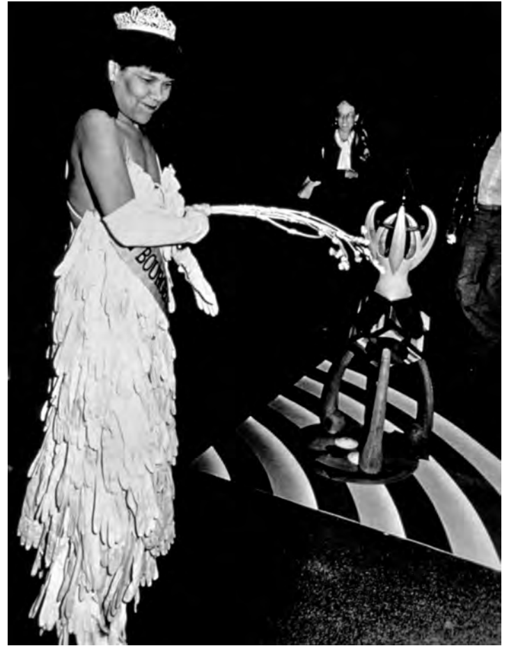
Mlle Bourgeoise Noire in character at the New Museum with the Whip-That-Made-Plantations-Move, from O'Grady's "Untitled (Mlle Bourgeoise Noire)", 1980-83/2009. Lorraine O'Grady/Artists Rights Society (ARS), New York; Alexander Gray Associates

The plumage of white gloves symbolized the repressed psychology of the Black middle class, consumed with respectability. The whip represented the history of external violence that conditioned it. Her critique was that Black artists should scrutinize their own privileges. Barging into the venue, she handed out flowers, then proceeded to flail herself with the whip, declaiming a poem. It concluded with the shout: "Black Art Must Take More Risks!"