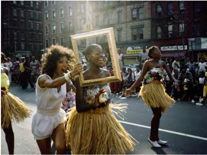
“Art Is... (Dancer in Grass Skirt),” 1983/2009.