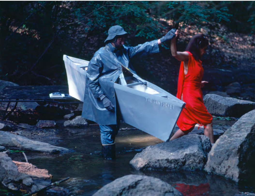
Lorraine O’Grady’s “Rivers, First Draft: The Nantucket Memorial guides the Woman in Red to the other side of the stream,” 1982/2015.