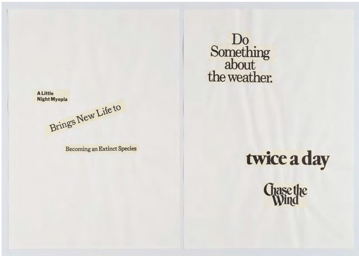
Lorraine O'Grady's newspaper poems, a collage with words cut from the New York Times, "Cutting Out CONYT 07," 1977/2017.

But it was Just Above Midtown that provided the setting for her breakthrough. She arrived in 1980 having learned it was the haunt of regulars such as David Hammons and Senga Nengudi.