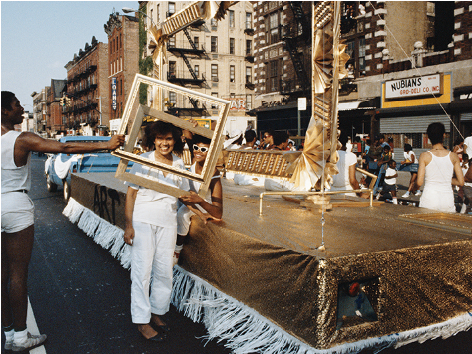
Lorraine O’Grady: Art Is . . . (Nubians) , 1983/2009, C-print, 16 by 20 inches. COURTESY ALEXANDER GRAY ASSOCIATES, NEW YORK. ©LORRAINE O’GRADY/ARTISTS RIGHTS SOCIETY (ARS), NEW YORK

any intelligence. O’Grady has had to create the gallery and the art historical audience (if not the audience that quite literally meets her work in the street) capable of understanding the work and meeting it on its own hybrid literary/theoretical/representational grounds.