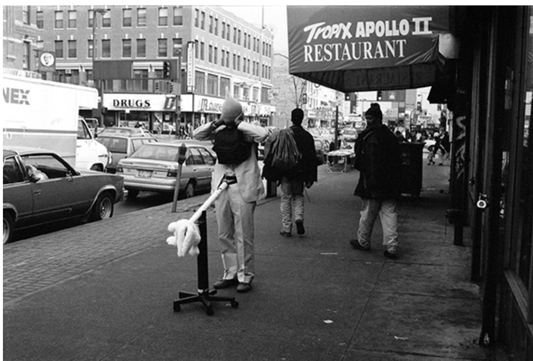
Pope.L: Member a.k.a. Schlong Journey, 125th Street, New York, 1996, inkjet print, 10 by 15 inches.