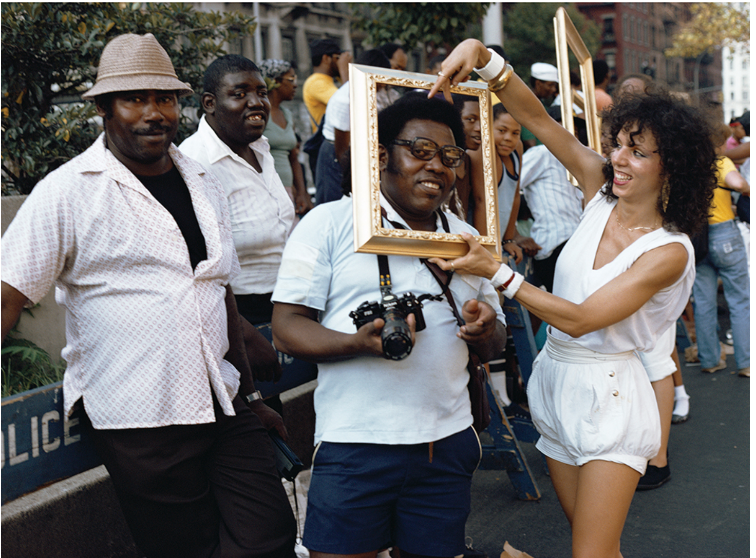
Lorraine O'Grady: Art Is. . . (Man with a Camera) , 1983/2009, C-print, 16 by 20 inches.

COURTESY ALEXANDER GRAY ASSOCIATES, NEW YORK. ©LORRAINE O'GRADY/ARTISTS RIGHTS SOCIETY (ARS), NEW YORK