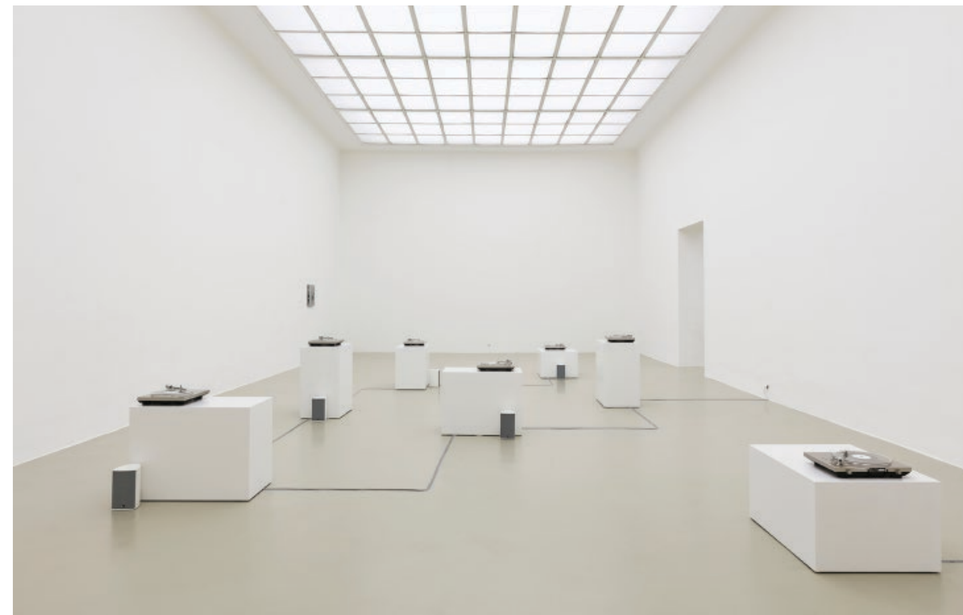
41/ Susan Philipsz, "A Single Voice" (2017), single-channel HD film and 12-channel sound installation, duration: 55 minutes, 51 seconds, looped, edition of three