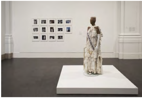
Works by Lorraine O'Grady in We Wanted a Revolution: Black Radical Women, 1965-85 at the Brooklyn Museum