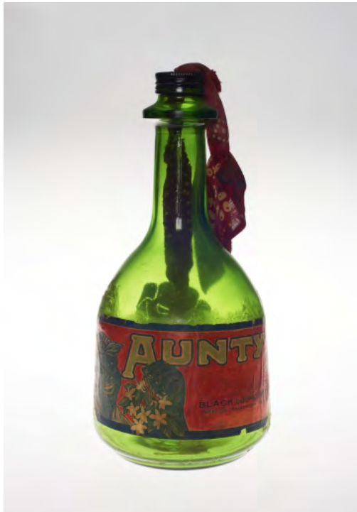
Betye Saar, "Liberation of Aunt Jemima: Cocktail" (1973), mixed-media assemblage, 12 x 18 in, private collection