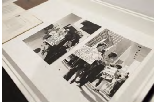
Installation view of We Wanted a Revolution: Black Radical Women, 1965–85 at the Brooklyn Museum

juxtaposition drives the point home that the political is also deeply embedded in the personal, and that taking a moment of reprieve in Rio could be just as radical as publicly calling out the art world's complicity in perpetuating racism and inequality.