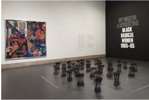
Installation view of We Wanted a Revolution: Black Radical Women, 1965-85 at the Brooklyn Museum

and alternative spaces formed in New York at the height of Women's Liberation in the '70s. The final galleries chronicle postmodern photography, performance, and multimedia art created in the wake of multiculturalism in the '80s. Quite poetically, one can't get to Chicago's "The Dinner Party," a permanent fixture of these galleries, without seeing some part of We Wanted a Revolution .