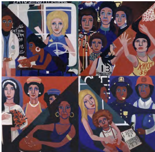
Faith Ringgold, "For the Women's House" (1971), oil on canvas, 96 x 96 in, courtesy of Rose M. Singer Center, Rikers Island Correctional Center (© 2017 Faith Ringgold / Artists Rights Society, ARS, New York)

On the heels of the Civil Rights movement, in a 1971 New York Times article , Toni Morrison made a terse assessment of the downstream effects of second-wave feminism, as observed by black women: