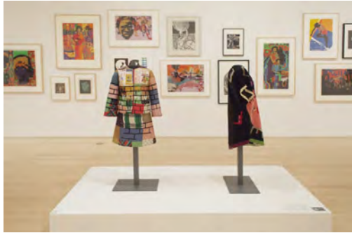
Installation view of We Wanted a Revolution: Black Radical Women, 1965–85 at the Brooklyn Museum

Morrison pointed to as black women’s perpetual self-invention and self-definition. These works and their histories are worthy of prime real estate in major museums and art institutions. How moving it was for me to see black women, young and old, photographing themselves in front of the exhibition’s opening text and seeing themselves in relation to the art on view. If you build it, they say, the people will come — and perhaps then the revolution finally will, too.