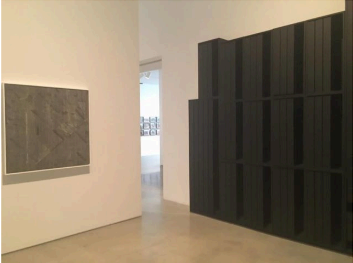
Jack Whitten “Epsilon II” and Louise Nevelson “City-Reflection”

Take, for example, the pairing of Jack Whitten’s “Epsilon II” series with Louise Nevelson’s monumental sculpture “City-Reflection.” This seemed an unexpected combination even though the works were made only four years apart. When viewed together, the geometrical shapes and hard lines in Whitten’s painting—made from sticks, rakes and Afro combs—play off the verticality and urban architectural references in Nevelson’s rectangular sculpture.