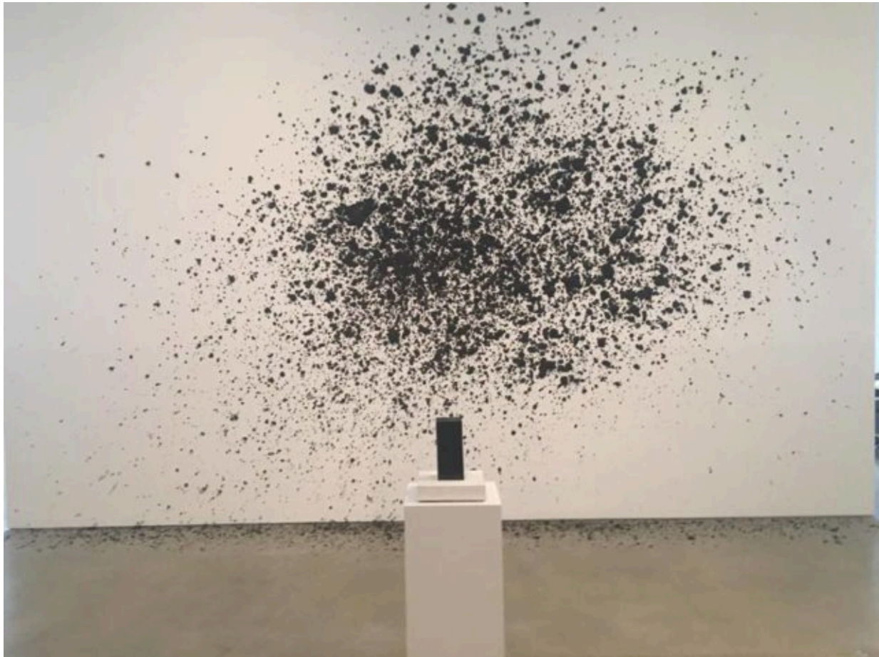
Wangechi Mutu's "Throw" at Blackness in Abstraction