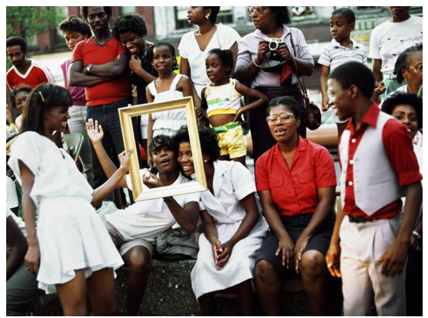
Art Is... (Women in Crowd Framed), 1983/2009. Chromogenic color print, 16 x 20 in. Courtesy Alexander Gray Associates, New York. © 2015 Lorraine O'Grady/Artist Rights Society (ARS), New York.

I was shocked, because I understood how the large frame would work, as documentation, but I didn't know what would happen with the people on the route. I guess I didn't understand what the power of a frame and a camera were.