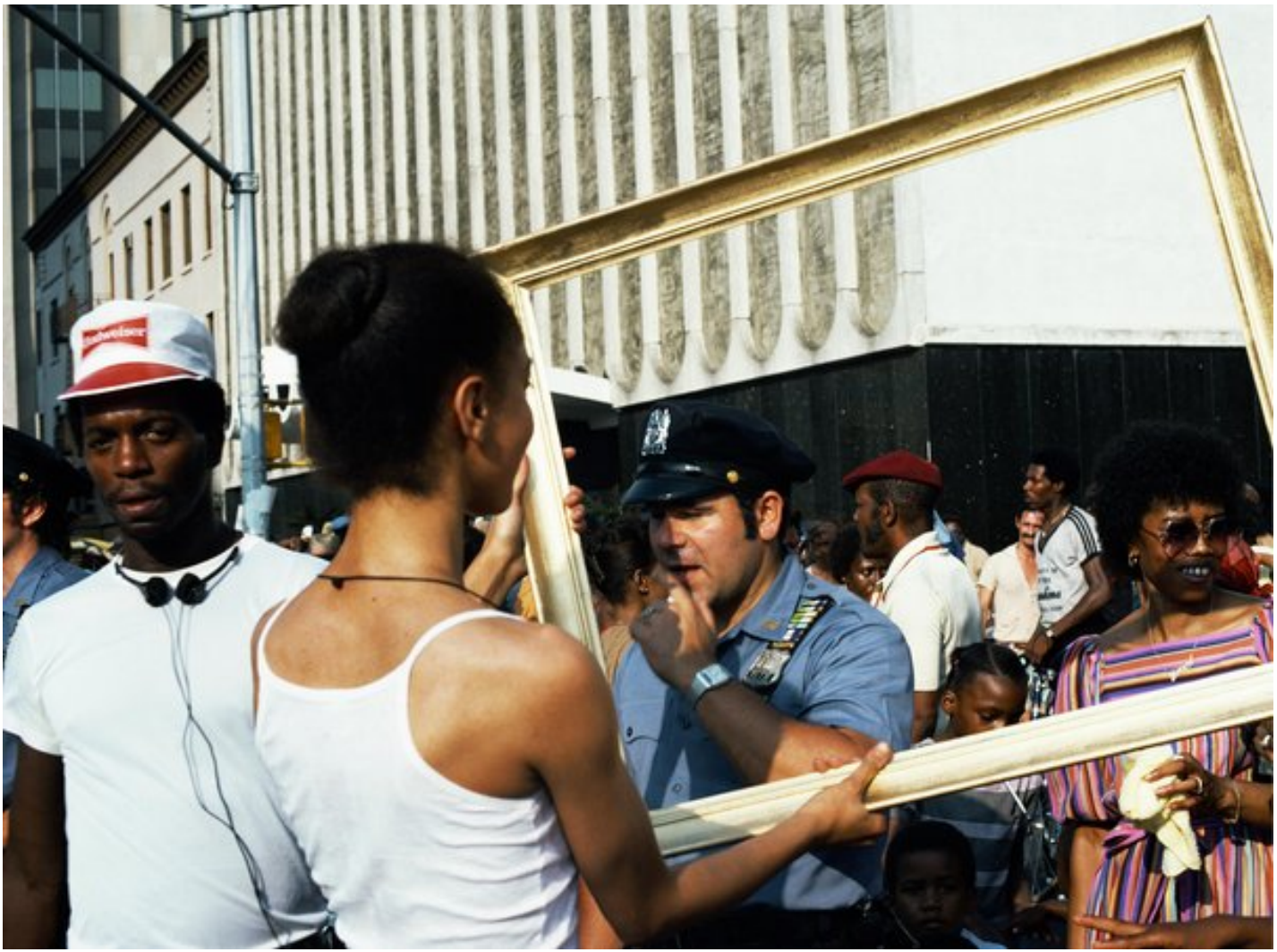
Art Is... (Cop Eyeing Young Man), 1983/2009. Chromogenic color print, 16 x 20 in. Courtesy Alexander Gray Associates, New York. © 2015 Lorraine O'Grady/Artist Rights Society (ARS), New York.

Oh, yeah. The entire thing, I think, could not happen now. It could not happen now because the parade viewers would not want to be bothered—and also because that parade was creating a film, and it was capturing everything on that route as cinema.