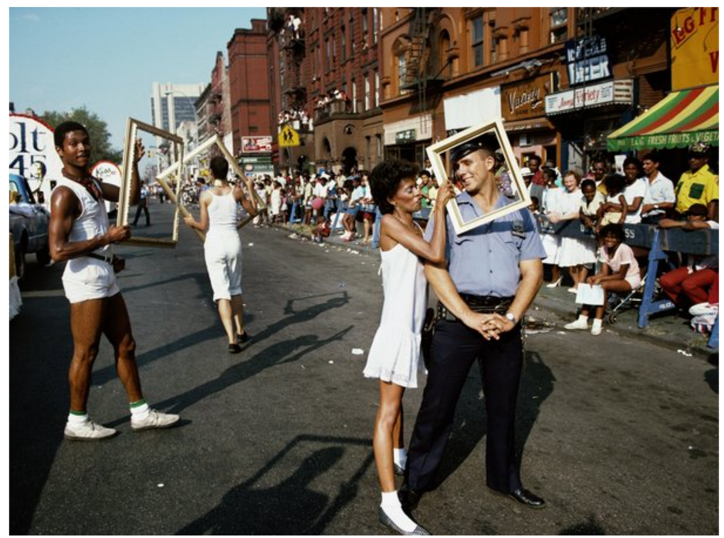
Art Is... (Cop Framed), 1983/2009. Chromogenic color print, 16 x 20 in. Courtesy Alexander Gray Associates, New York. © 2015 Lorraine O'Grady/Artist Rights Society (ARS), New York.

I don't know how much of that also was that the people I hired to carry those frames were all actors and actresses—like many people in show business they were not native New Yorkers, and they were coming from a different place with a different relationship to the police.