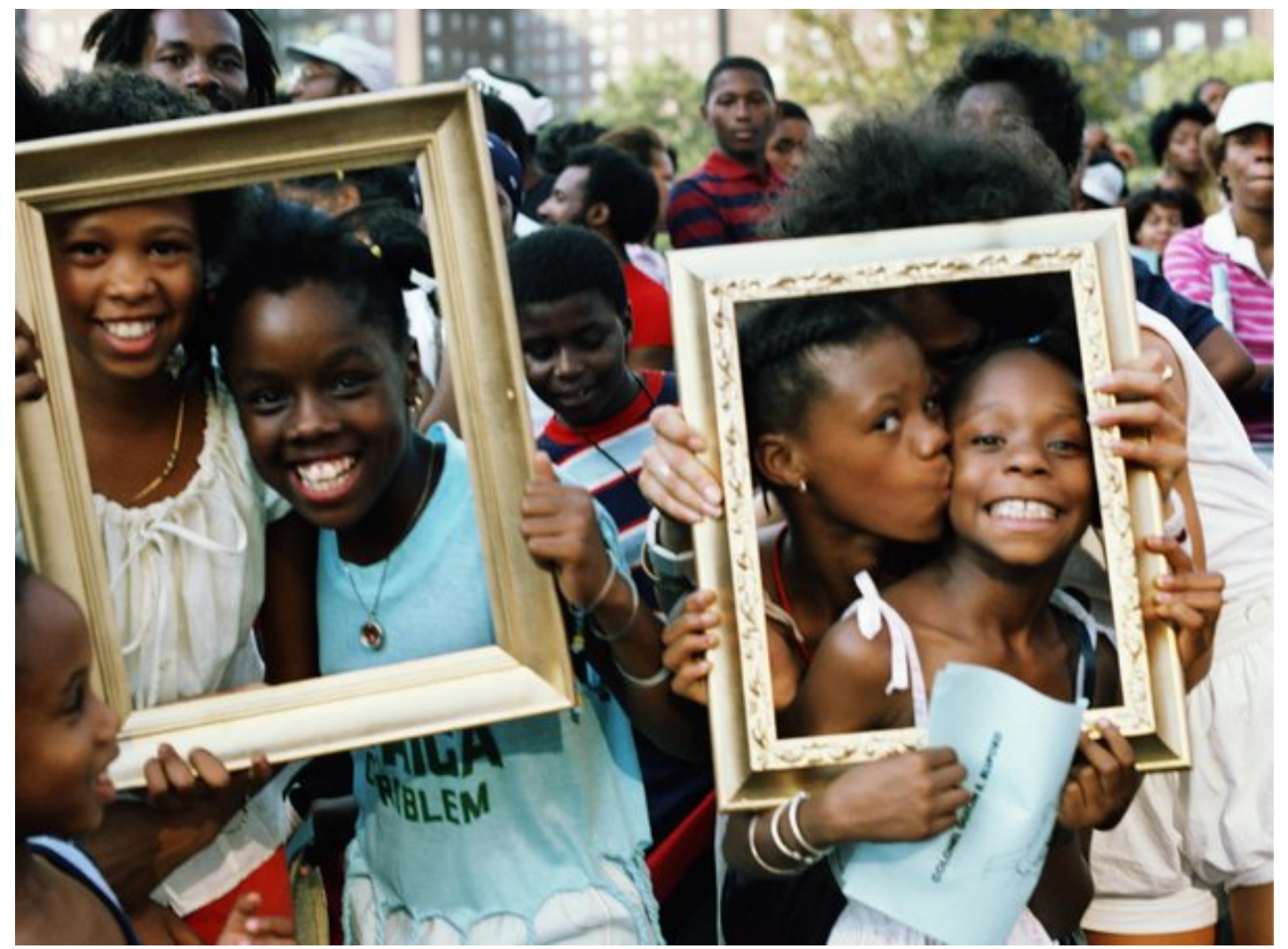
Art Is... (Girlfriends Times Two), 1983/2009. Chromogenic color print, 16 x 20 in. © 2015 Lorraine O'Grady/Artist Rights Society (ARS), New York.

How did you get from those initial performance documents to the current format of Art Is... ? It's been exhibited as a series of photographs in recent years, in places ranging from Art Basel Miami Beach to the touring museum survey "Radical Presence: Black Performance in Contemporary Art," now at the Yerba Buena Center for the Arts in San Francisco.