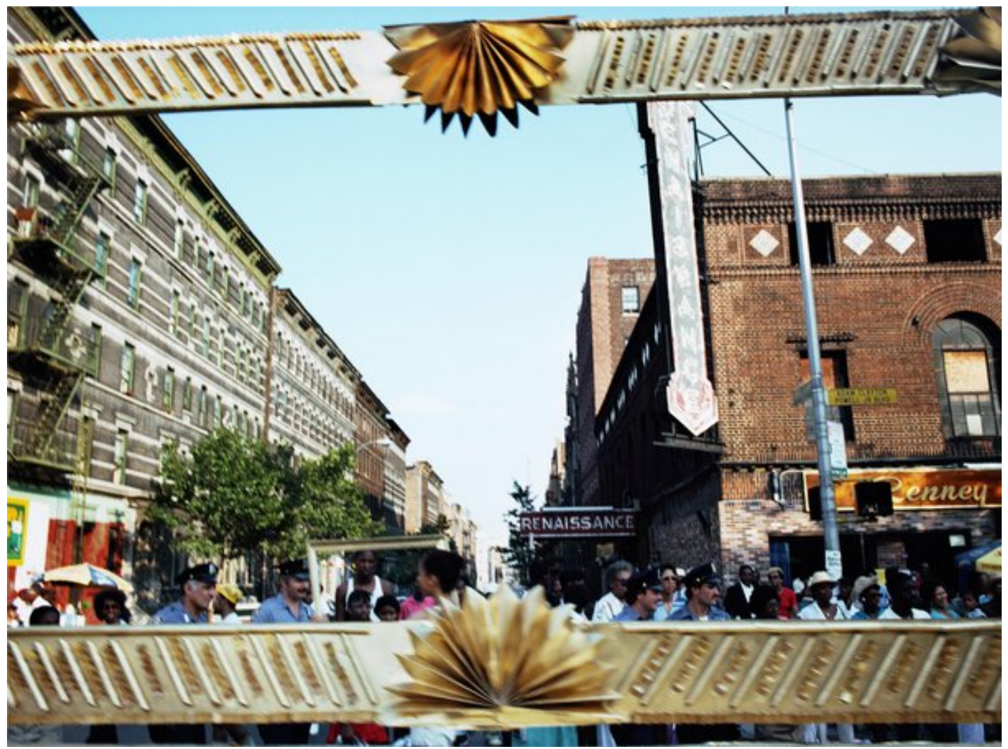
Art Is... (Faded Renaissance), 1983/2009. Chromogenic color print, 16 x 20 in. Courtesy Alexander Gray Associates, New York. © 2015 Lorraine O'Grady/Artist Rights Society (ARS), New York.

When I got asked to do it as an installation, I really resisted that idea. Then, in the process of doing it, I understood the parade but also realized that I had created a very separate artwork. The parade was one thing, and this was the artwork out of the parade.