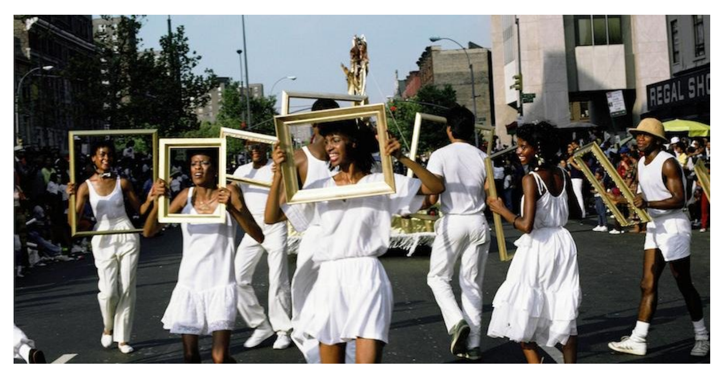
A detail of Lorraine O'Grady's Art Is... (Troupe Front) , 1983/2009. Chromogenic color print, 16 x 20 in. Courtesy Alexander Gray Associates, New York. © 2015 Lorraine O'Grady/Artist Rights Society (ARS), New York.

The 1983 African-American Day Parade, on Harlem's 125<sup>th</sup> Street, included a rather unusual float—a gold-skirted vehicle topped by a giant, gilded picture frame. Atop it, 15 actors in all-white clothing danced with smaller frames; as the float moved along its route, they leapt out into the crowd and held them up to intrigued spectators, who summarily found themselves making art, or having art made of them.