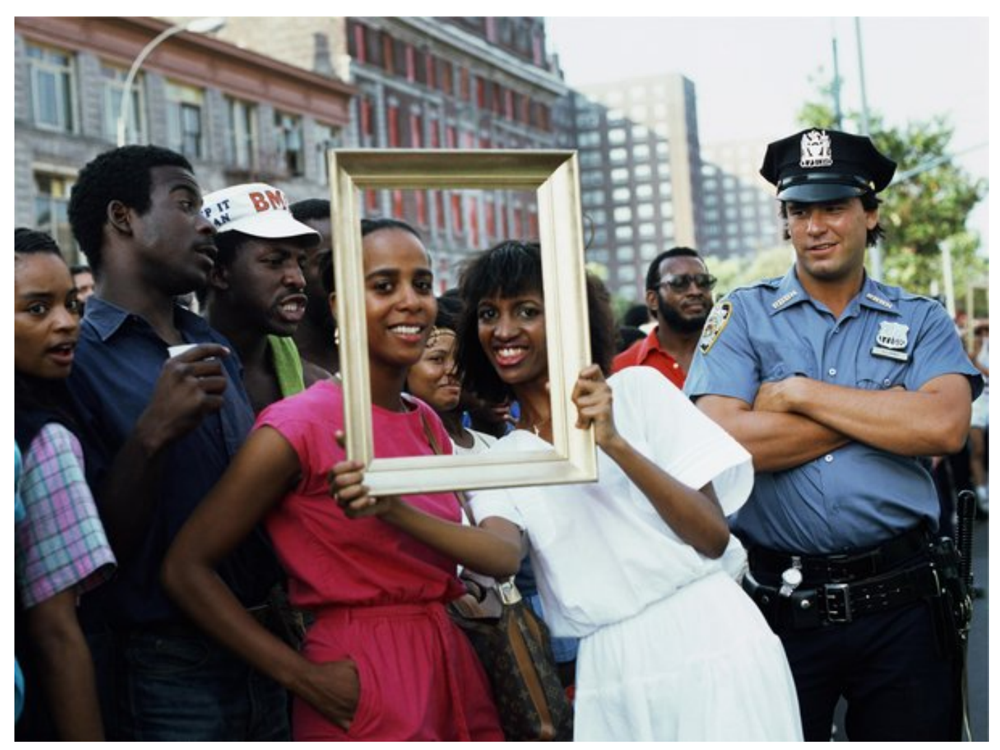
Art Is... (Woman with Man and Cop Watching), 1983/2009. Chromogenic color print, 16 x 20 in. Courtesy Alexander Gray Associates, New York. © 2015 Lorraine O'Grady/Artist Rights Society (ARS), New York.