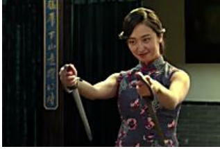
In Xu Haofeng's Excellent 'The Final Master,' the Talking Is as Good as the Fighting