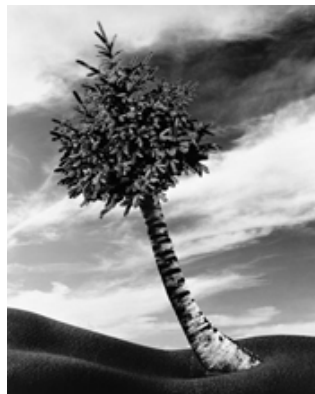
Lorraine O'Grady The Fir-Palm 1991/2012 Alexander Gray Associates, New York