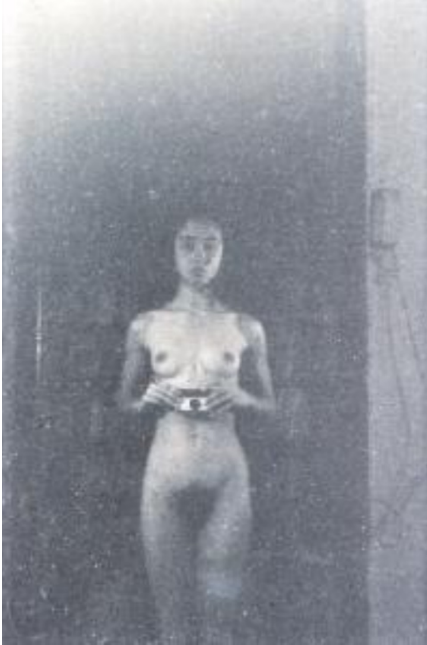
Adrian Piper, Food for the Spirit

In the work, Piper looks and demands to be looked at in a most specific way; she is both the black female body in the frame and the maker of the picture at once. Lorraine O'Grady calls it "the catalytic moment for the subjective black nude." In her total nudity — stripped down in more ways than one — Piper enacts a politic of looking wherein her direct gaze (bouncing around the frame in a near-closed loop) triangulates between eye mirror and lens while we, the audience, view her as though from the other side of a one way mirror. Looking at Piper looking at herself, one becomes aware of the rarity of the moment. Where else, particularly within art history, do we see black women looking straight at themselves and making that looking public? Or as Lorraine O'Grady asks in Olympia's Maid: Reclaiming Black Female Subjectivity :